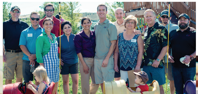
Pie Consulting & Engineering staff have made this event possible for five years!

Because of the support provided by our generous sponsors, in-kind supporters and event guests, total funds netted more than $36,000 for Anchor Center for Blind Children in support of essential programs and services.