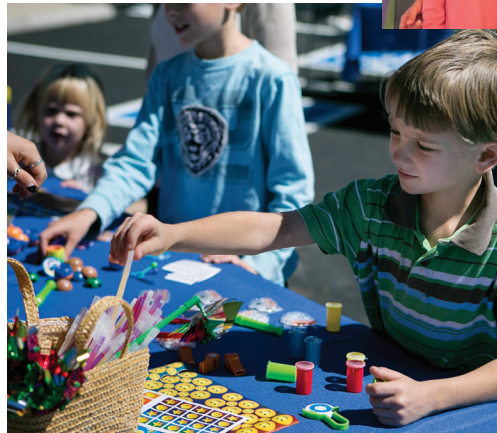
Kids had fun making braille bookmarks with a tactile symbol.