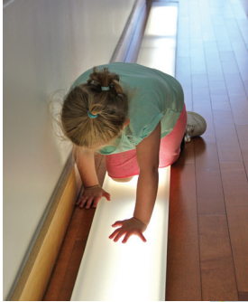
Lighting helps us navigate safely.