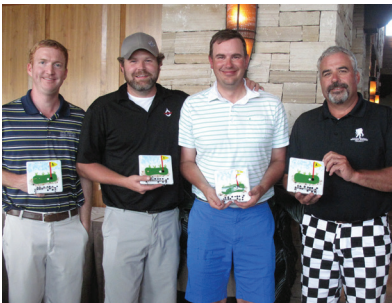
Superior Drilling Products took first place.