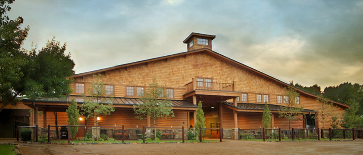
J-5 Equestrian Center, Sunset in the Country 2018 venue, located at 6900 S Platte Canyon Rd, Littleton, CO 80128